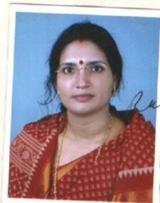
ARNVAL Advocate Court, Ranchi No.-50405

अधिनियम 21 के अन्तर्गत तथा अधिनियम नम्बर 1908 के अन्तर्गत अधिनियम को लागू है। अधिनियम स्टाम्प अधिनियम 1899 की अनुसूची 1 की क म अधिनियम अधिनियम अधिनियम या स्टाम्प शुल्क विमुक्त या स्टाम्प शुल्क अपेक्षित नहीं है।